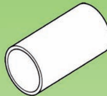
Pressure Plate Depressor Part No. 01J.TOOL04

The clearance for the reverse brake is suggested to be around 1.30mm to 1.50mm and is determined by subtracting the distance of the cover plate to the apply piston, from the distance of the clutch pack to the edge of the case.